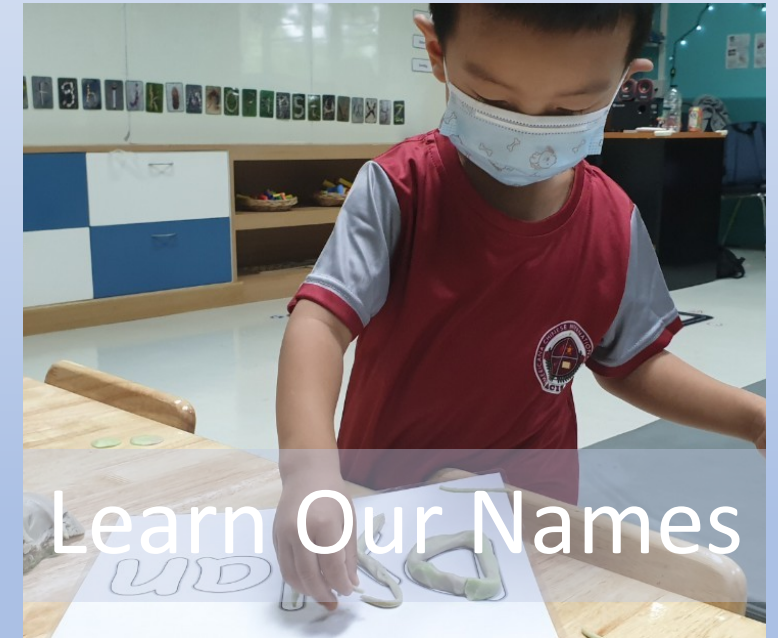
Learn Our Names